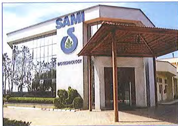
Figure 1 – SAMI (Sabinsa) FDA-inspected facility for production of LactoSpore® (Bangalore, India).

loss of viable count. B. coagulans does not require refrigeration conditions and is room-temperature stable. Each batch of LactoSpore® produced in Sabinsa's FDA-inspected biotechnology facility is inspected for sporulation and purity (Figure 1). The LactoSpore® powder produced in this facility is standardized to 15 billion spores per gram. Lower spore counts – e.g., 6 billion spores per gram – are also produced.